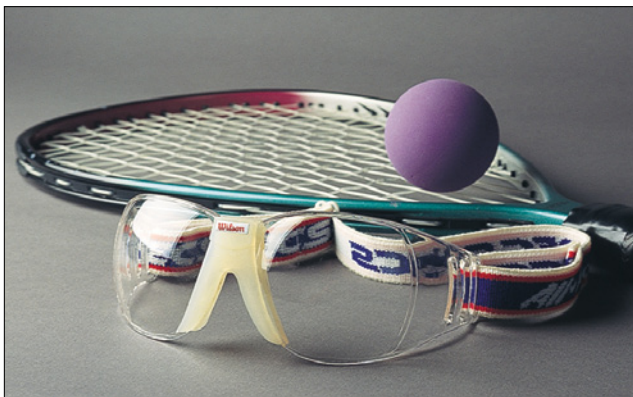
Protective eyewear is recommended for racquet sports.

Increasing numbers of children are participating in sports at an early age. Many sports have official standards for safety equipment.