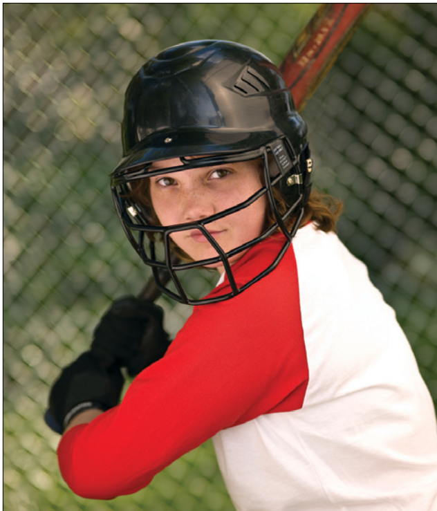
Children should wear sports eye protectors when participating in a number of sports, including baseball.

Boxing and full-contact martial arts pose an extremely high risk of serious and even blinding eye injury. There is no satisfactory eye protection for boxing, although thumbless gloves may reduce the number of boxing eye injuries.