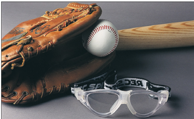
Protective sports eyewear

Choosing a sturdy frame will reduce the risk of injury from the frames themselves. Frames that meet the ANSI industrial standards offer the best available protection for general spectacle wear.